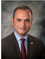
Featuring Mayor Zareh Sinanyan with the 2019 State of the City Address

Please respond no later than Friday, March 22nd